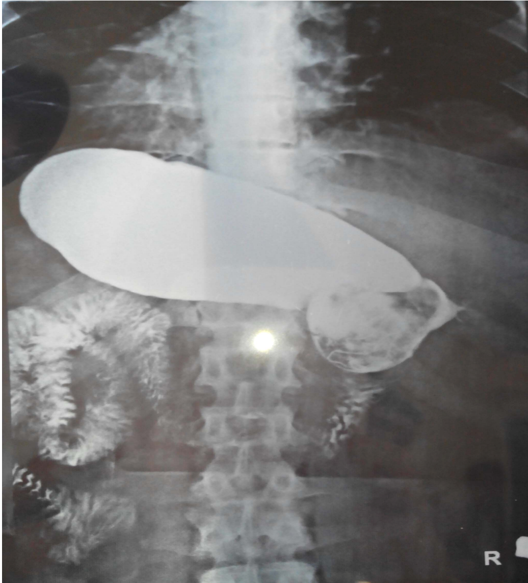
Figure 1. Barium swallow showing mass like lesion at Antro-duodenal area.

practitioners but had no relief. He had a bout of fever which was associated with rigor and chills and remained for one week. He was treated with oral antibiotics and got relief. There was no relief in pain abdomen and vomiting and the intensity increased in last two weeks, before he reported in our institute. In these last two weeks he was not able to accept anything orally and was being maintained on intravenous fluids. Laboratory parameters revealed mild anemia, normal liver and renal function tests. The barium swallow (Figure 1) and abdominal ultrasonogram revealed a mass located in the distal part of stomach and duodenum which gave suspicion of gastric carcinoma. Hence, endoscopy was performed for proper diagnosis. A written informed consent including surgical risks was obtained from the patient and