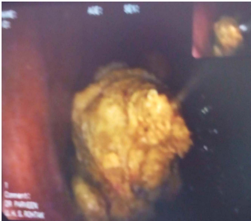
Figure 3. Gossypioma being removed with Snare.