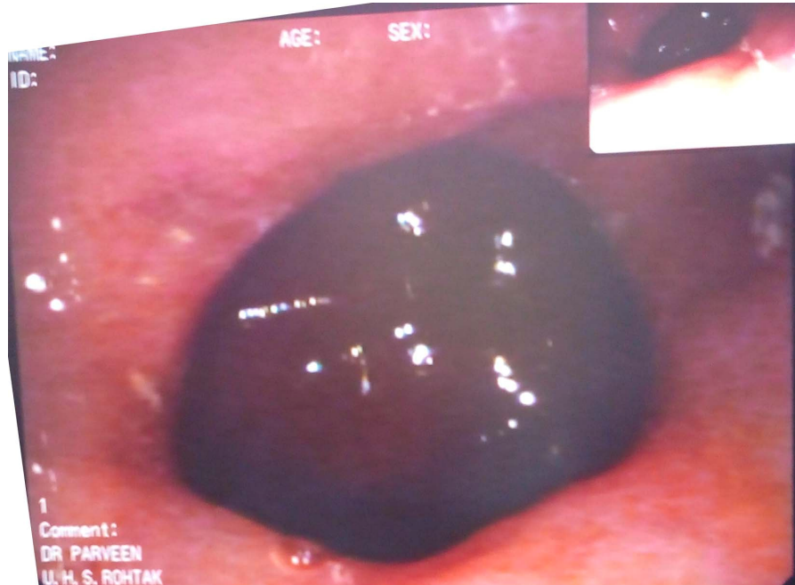
Figure 4. Hugely dilated Antrum after removal of stucked Gossypioma.