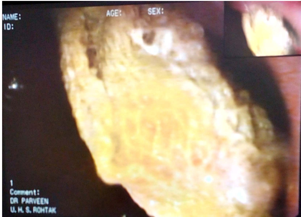
Figure 2. Large Gossypioma occupying whole of stomach.